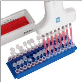
Access to tube racks