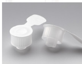
White Tyvek ® adaptor cap Cat. No. 167525

Each Nunc Cell Factory system includes a set of: