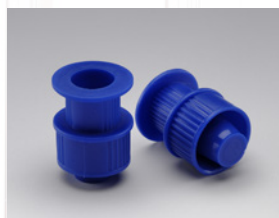
Port cover cap, blue Cat. No. 170615