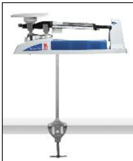
Included Rod & Clamp accessory for specific gravity experiments