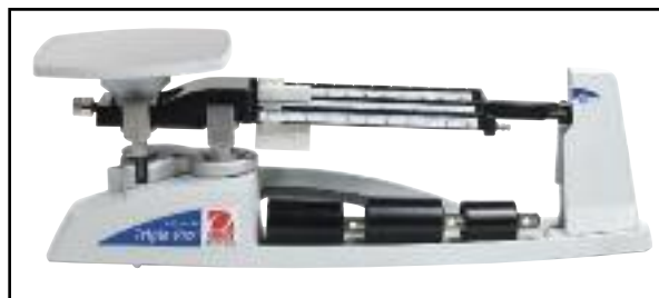
Three masses included with balance