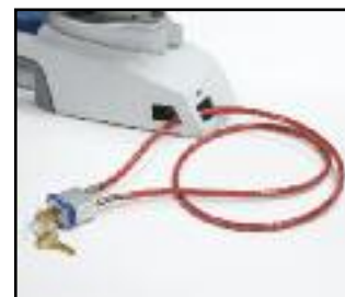
Security Device accessory (Lock & cable sold separately)