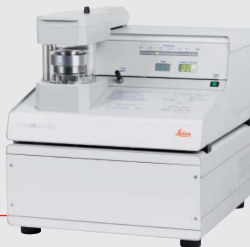
Leica EM MED020 Modular High Vacuum Coating System