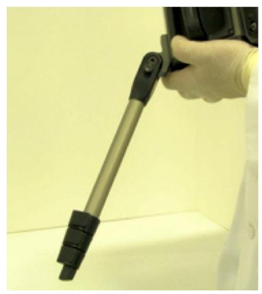
FIGURE 4.3 LEG PUSH PIN LOCKED IN PLACE

Unfold the leg until the push pin pops out and locks the leg into place as shown in Figure 4.3. Open the leg latches, as shown in Figure 4.4, and telescope the legs out to the desired height.