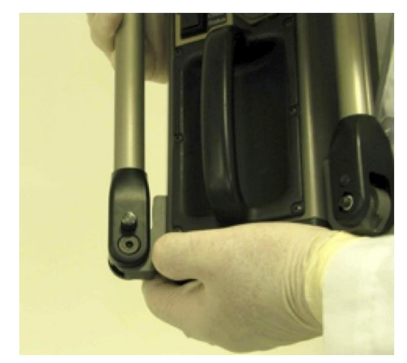
FIGURE 4.1 LOCKING PUSH PIN LOCATION AT LEG HINGE

Select the desired area for sample collection. For each leg, push the locking push pin located on the leg hinge at the base of the Bobcat as shown in Figure 4-1 and 4-2. It should be noted that the Bobcat cannot be operated with the legs in the upright position since the exhaust vents are located on the bottom of the unit.