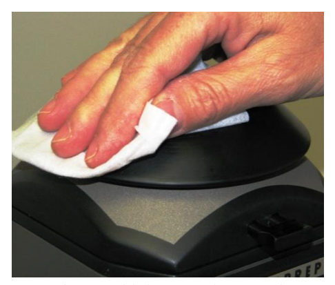
FIGURE 4.20 CLEANING EXTERIOR SURFACES

Open one of the cleaning wipe packets contained in the Bobcat Cleaning and Maintenance Kit and use the enclosed towelette to wipe down the exterior surface of the inlet as shown in Figure 4.20. Wet the foam tipped applicator with the cleaning wipe and clean the inlet under the inlet cap as shown in Figure 4.21. Open the second cleaning wipe packet contained in the Bobcat Cleaning and Maintenance Kit and use the enclosed towelette to wipe down the interior surfaces of the sampler as shown in Figure 4.22.