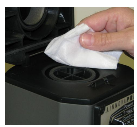
FIGURE 4.22 CLEANING INTERIOR SURFACES