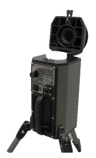
FIGURE 1.1 ACD-200 BOBCAT

The InnovaPrep ACD-200 Bobcat, shown in Figure 1.1, is a lightweight, portable, dry filter air sampler with a unique rapid filter elution system. The Bobcat aerosol collector takes up little more than one-quarter of a cubic foot, has an internal battery, built-in tripod, and can run continuously at 200 liters per minute for up to 18 hours. The system has a built-in, omni-directional aerosol inlet, easy to read status display, and a built-in handle. The system is equipped with a mass flow sensor that allows for consistent sampling rates through out the collection cycle. It can be operated in four programmable run modes that allow the user to balance collection rate with battery life. The system is easy to use and operators can be trained in a little as 10 minutes. Installation of the filter cassettes and the controls can be manipulated with gloved hands, while wearing personal protective equipment such as military-style nuclear/biological/chemical (NBC) protective suits.