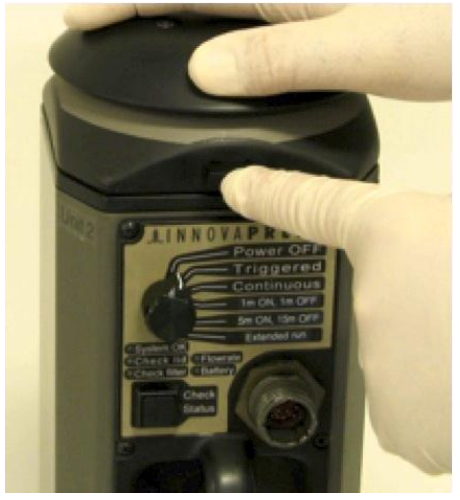
FIGURE 4.14 ENGAGING LATCH