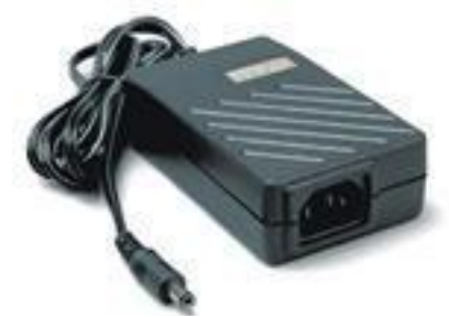
FIGURE 4.6 EXTERNAL POWER SUPPLY WITH BARREL PLUG