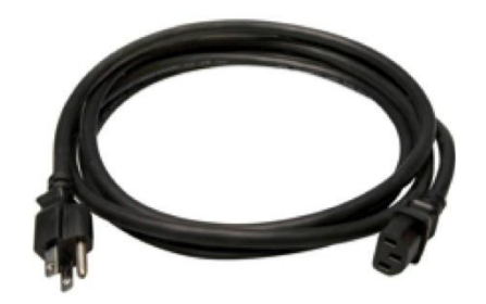
FIGURE 4.7 AC POWER CORD