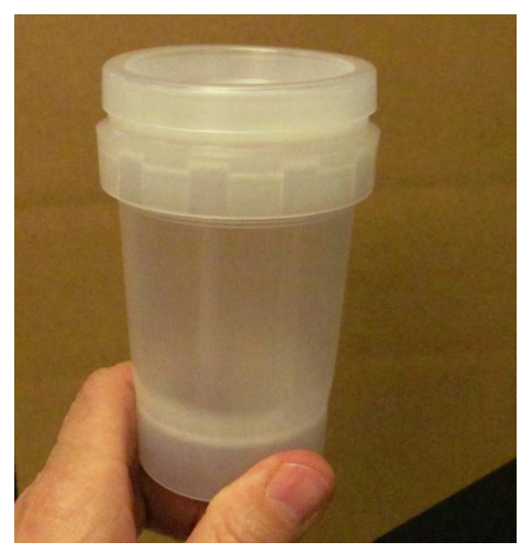
FIGURE 4.18 SAMPLE READY FOR TRANSPORT TO THE LABORATORY