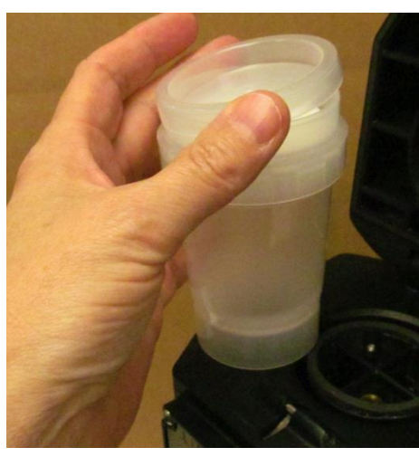
FIGURE 4.17 SAMPLE CUP LID SNAPPED INTO THE FILTER CASSETTE