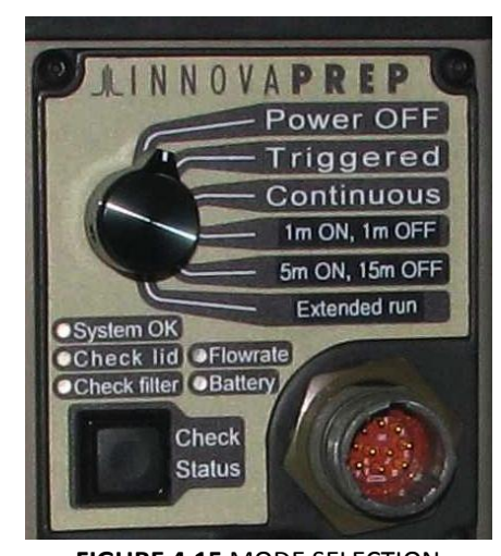
FIGURE 4.15 MODE SELECTION KNOB

To operate the unit in the "Triggered" mode, the user will need to contact InnovaPrep to design a program specific to the user's requirements. The software