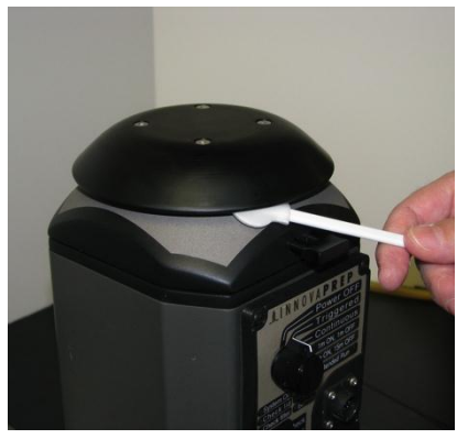
FIGURE 4.21 CLEANING INLET WITH FOAM TIPPED APPLICATOR