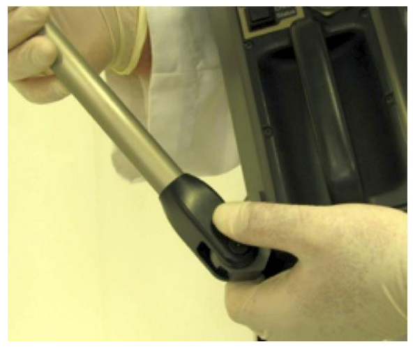
FIGURE 4.2 UNLOCKING AND UNFOLDING LEG

Unfold the leg until the push pin pops out and locks the leg into place as shown in Figure 4.3. Open the leg latches, as shown in Figure 4.4, and telescope the legs out to the desired height.