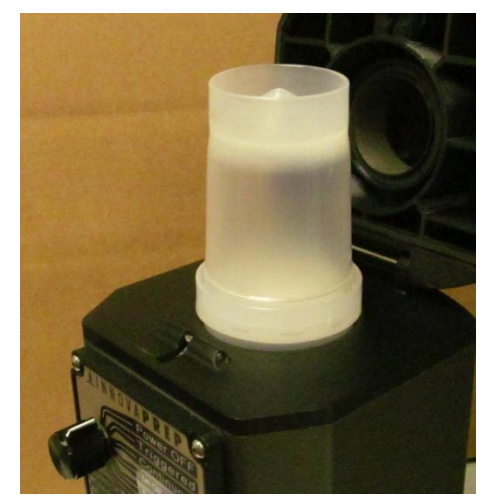
FIGURE 4.16 SAMPLE CUP SNAPPED INTO THE FILTER CASSETTE

When the run is completed, the filter sample is recovered by unlatching the lid of the unit, reaching in and snapping the sample cup into the top of the filter cassette as shown in Figure 4.16. The filter cassette and sample cup are then lifted out of the collector, flipped over, and capped with the sample cup cap as shown in Figure 4.17. The assembly, as shown in Figure 4.18, can then be transported to a laboratory space for elution or may be eluted while in the field.