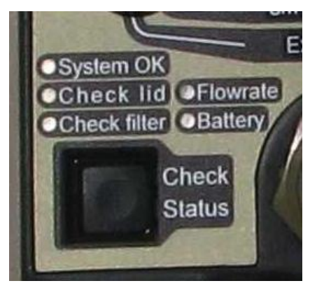
FIGURE 3.2 CHECK STATUS BUTTON AND LEDS

The ACD-200 is equipped with five LEDs that communicate the status of the unit to the user. The appropriate LEDs are illuminated when "Check Status" button is pushed. The red "Check lid" LED is illuminated when the lid is open or the lid release is not completely pushed in. The red "Check filter" LED is illuminated if there is not a filter cassette present in the sampler. The "Flowrate" LED is illuminated when the internal mass flow sensor is measuring a flow rate less than what has been selected. This may be due to an overloaded filter or a blockage at the exhaust vents located on the bottom of the unit. The "Battery" LED is illuminated when the battery needs to be recharged.