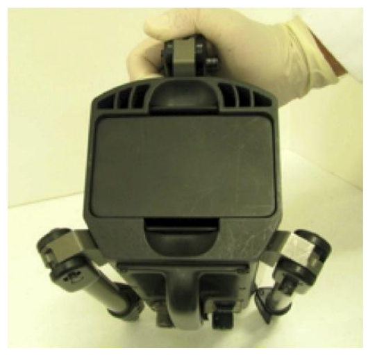
FIGURE 4.8 BATTERY COVER ON THE BOTTOM OF THE UNIT

The battery is installed into the unit with the battery socket towards the front of the unit as shown in Figure 4.11. Reinstall the Battery Cover by pushing it into the bottom of the unit until both clips click into place.