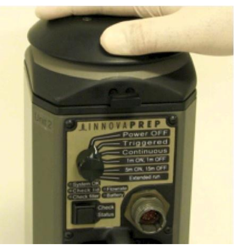
FIGURE 4.13 CLOSING LID