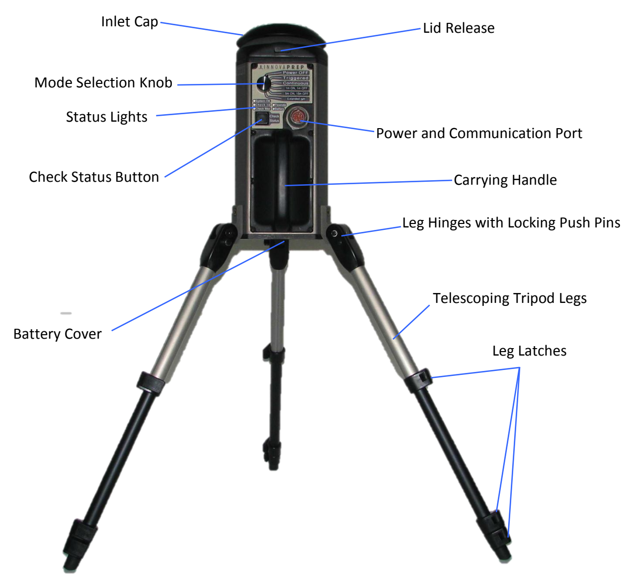
FIGURE 3.1 COMPONENTS OF THE ACD-200 BOBCAT

The following section describes the components of the InnovaPrep ACD-200 Bobcat air sampler.