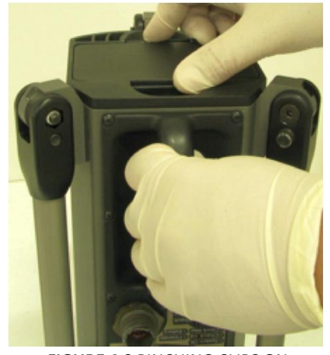
FIGURE 4.9 PINCHING CLIPS ON BATTERY COVER