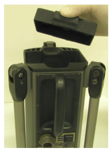
FIGURE 4.10 REMOVING BATTERY COVER