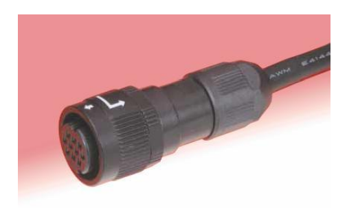
FIGURE 4.5 10-PIN CONNECTOR ON POWER AND COMMUNICATON CABLE

Communication Cable. Plug one end of the AC Power Cord (Figure 4.7) into the External Power Supply and plug the other end into an appropriate wall outlet.