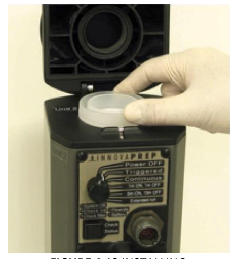
FIGURE 4.12 INSTALLING FILTER CASSETTE

Open the ACD-200 by putting one hand on top of the unit and, grasping the Lid, grip the Release with your other hand and pull the Lid Release straight out. The top will now open on its hinge. Set the filter cassette into the top of the ACD-200 and press it firmly into place, as shown in Figure 4.12. The filter housing is designed to only fit in one way one way. Close the lid and hold it down while pushing the lid latch straight in to lock it in place, as shown in Figures 4.13 and 4.14.