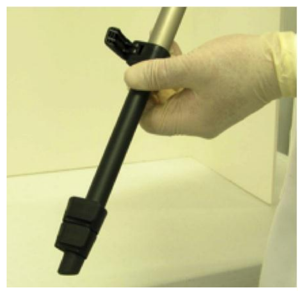
FIGURE 4.4 OPENING LEG LATCH FOR ADJUSTMENT

Supporting the back of the unit with one hand, push the 10-Pin Connector (see Figure 4-5) on the Power and Communication Cable into the Power and Communication Port on the front of the unit. It will automatically lock into place. Push the barrel plug on the external power supply (see Figure 4.6) into the barrel jack on the Power and