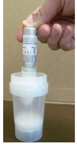
FIGURE 4.19 ELUTION OF FILTER