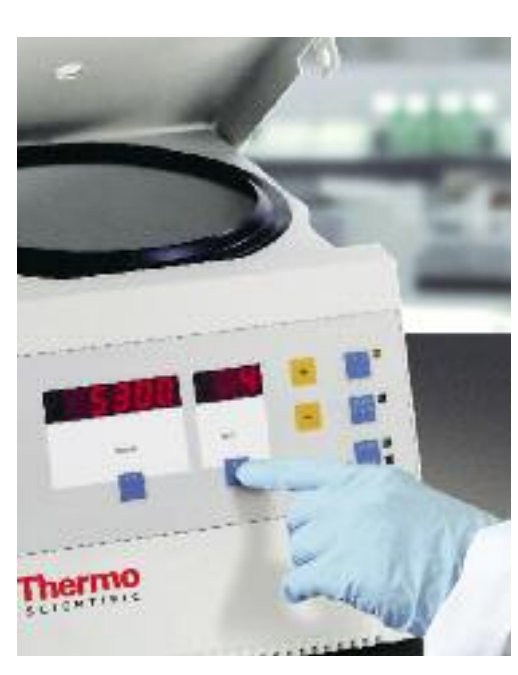
Easily set the run speed and time. Recall previous runs by simply pressing "Start."

The compact Thermo Scientific Heraeus Clinifuge centrifuge accommodates a broad range of blood collection tubes, making it ideal for use in medical practices, clinical and small laboratories or as a stand-by unit in large laboratories. Shipped with a rotor and all necessary adapters, the Heraeus® Clinifuge centrifuge is operational the day it is received.