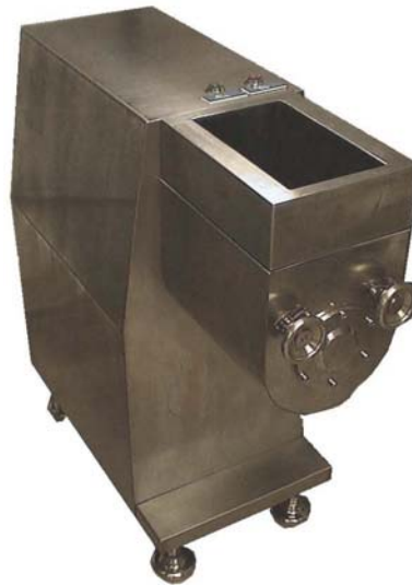
Mill Side View