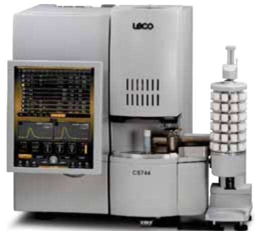
CS744 with optional autoloader