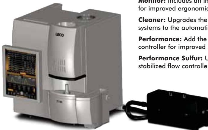
CS744 with high-velocity vacuum system