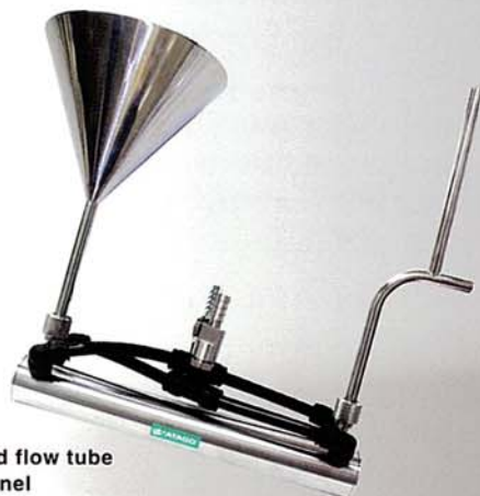
Jacketed flow tube with funnel