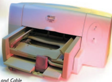
HP Deskjet Color Printer and Cable