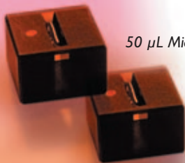
50 \mu L Microcell