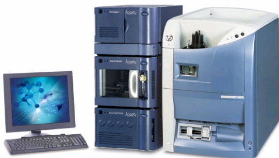
Waters ACQUITY UPLC System with the Waters Micromass Quattro Premier XE Mass Spectrometer.

This technical note compares the sensitivity of the Quattro Premier with that of the the Quattro Premier XE tandem quadrupole mass spectrometer in negative ion mode, using 2 test compounds: the non steroidal anti-inflammatory (NSAID) drug Ibuprofen, and the steroid Prednisolone.